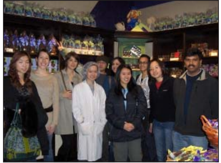
BCFT Students recently visited Purdy's Chocolates in Vancouver as part of three different student tours of local food companies.

Purdy's Chocolate was a delightful tour, where the chocolate making process was fully discovered from caramel filling to coconut clusters. This tour put into